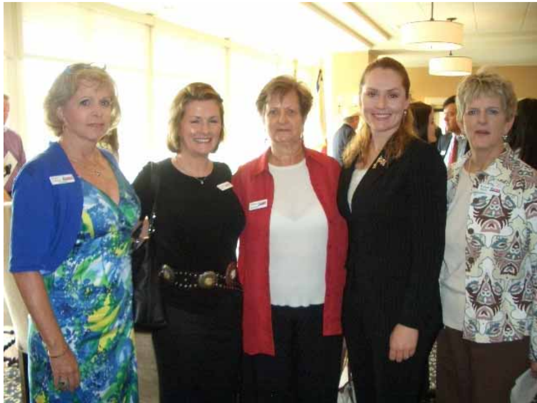
ARW ladies at the September 2010 luncheon

*This process is effective through the deadline of each event.