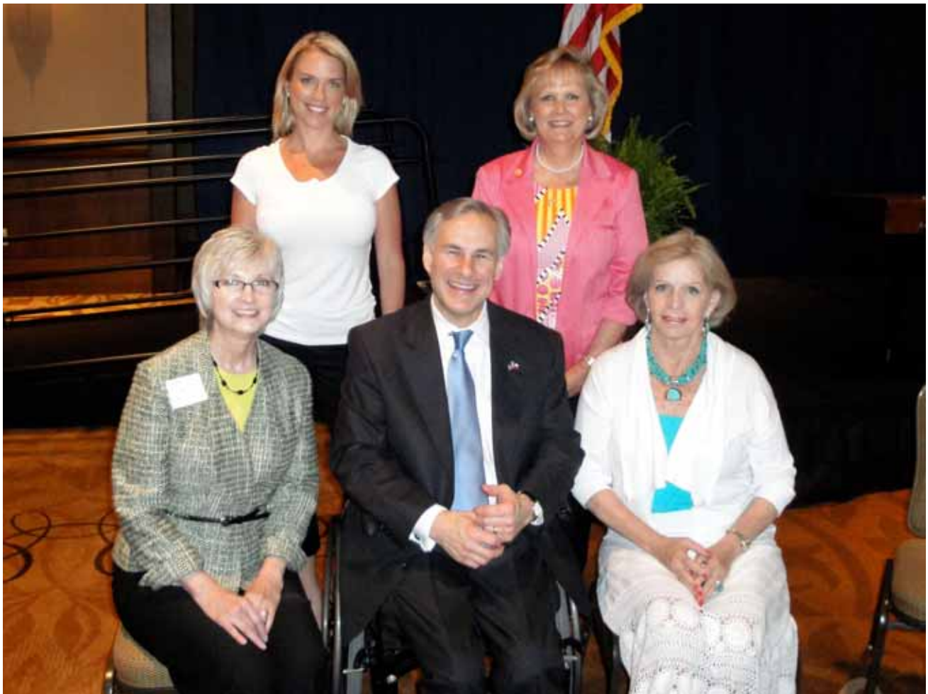
ARW members with Texas Attorney General Greg Abbott.