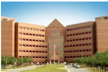
Brooke Army Medical Center

When we think of those injured and suffering from the Iraq and Afghanistan wars, we typically think of those who have directly served overseas. We often forget those closest to our soldiers who serve as well. For the U.S. Marine Corps, BAMC is reserved for the worst injuries Marines receive in these wars, from severe burn injuries to amputations. When this happens, Marines have to heal and learn how to live with their injuries. This emotional and physical healing and rehabilitation process can take years to accomplish. Wives, children and parents suffer alongside their loved ones through this process.